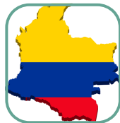
Colombians in Fort McMurray