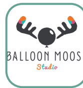
Balloon Moose Studio balloonmoose.ca balloonmoosestudio@gmail.com 780.607.0049