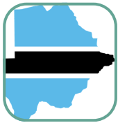
Fort McMurray Botswana Association