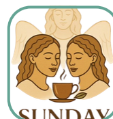
Sunday Coffee Roaster Coffee.Sunday@yahoo.com 780.370.3837