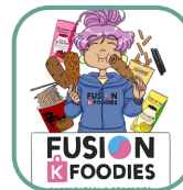
Fusion K Foodies fusionkfoodies2022@yahoo.com 780.607.4336