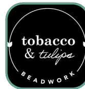
Tobacco & Tulips