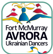
Fort McMurray Aurora Ukrainian Dancers and Cultural Society fortmcmurrayavroradancers.ca fortmcmurrayavroradancers@outlook.com